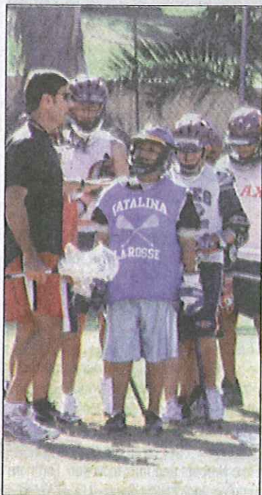
Catalina Lacrosse Club officials and kids enjoy taking part in the recent clinic at the Field of Dreams. The event helped introduce Island kids to the game that has become a popular and successful sport in Avalon.